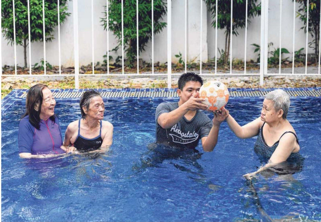
Residents of St Bernadette Lifestyle Village, an assisted living facility, at one of their regular activities. Such a facility is an alternative to nursing homes for seniors who do not require intensive medical and nursing care, but need help with daily living activities such as showering.