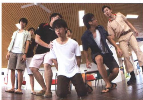
The Operation Theatre cast started rehearsals in April.

Enquiries can be directed to ot5.marketing2014@gmail.com